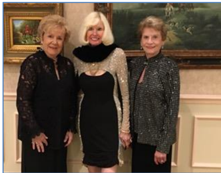
Dressed to impress!