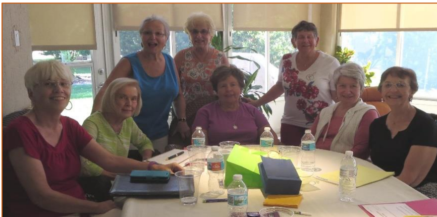
40 th Anniversary Committee Hard at Work

Lake/Sumter AAUW will hold a celebration in honor of the 40th anniversary of this branch on Saturday, March 16, 2019 at Allamanda Recreation Center as an early brunch and program. Tickets for this special event will go on sale at our next general meeting on Saturday, October 20. The cost is $25.00. Look for our table and don't miss out.