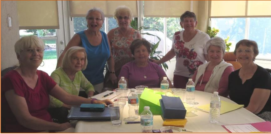
40 th Anniversary Committee Hard at Work

Lake/Sumter AAUW will hold a celebration in honor of the 40th anniversary of this branch on Saturday, March 16, 2019, at Allamanda Recreation Center with an early brunch and program. Tickets for this special event will go on sale at our next General Membership Meeting. The cost is $25. Look for our table at the fall meetings and don't miss out.