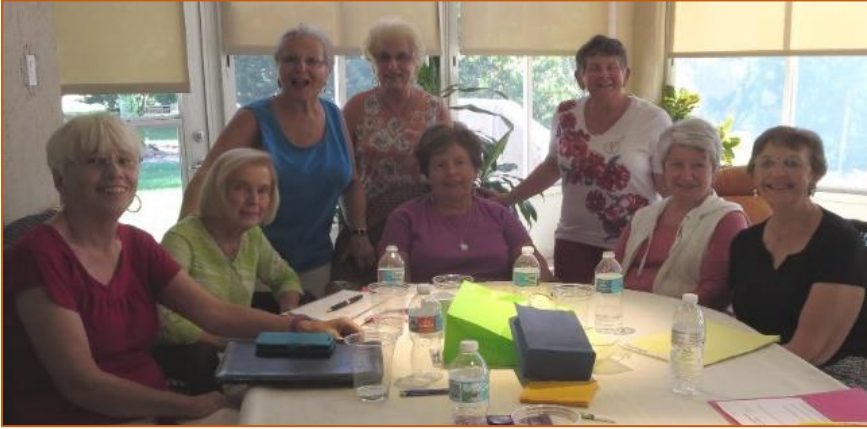
40 th Anniversary Committee Hard at Work

Lake/Sumter AAUW will hold a celebration in honor of the 40th anniversary of this branch on Saturday, March 16, 2019, at Allamanda Recreation Center as an early brunch and program. Tickets for this special event will go on sale at our next general meeting. The cost is $25.00. Look for our table at the fall meetings and don't miss out.