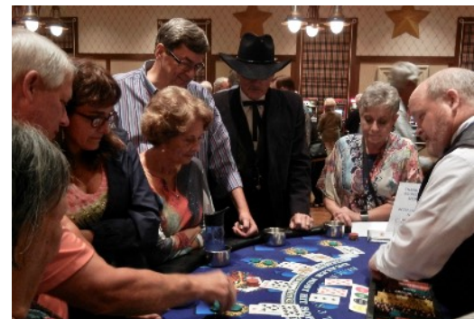
Action at the slot machines, blackjack, roulette and Texas Hold'em tables was heavy all evening