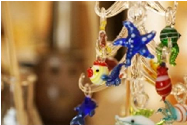
HELD IN SUSPENSE

Link to art contest: svc.aauw.org/contests/NoteCardEntries_wp.cfm