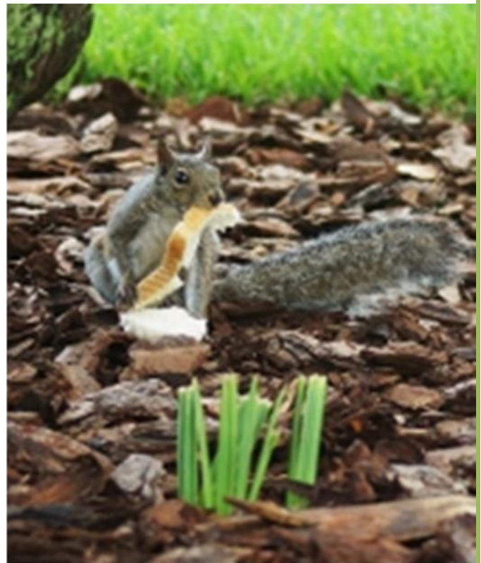
SCIURIDAE NEED TO EAT TOO