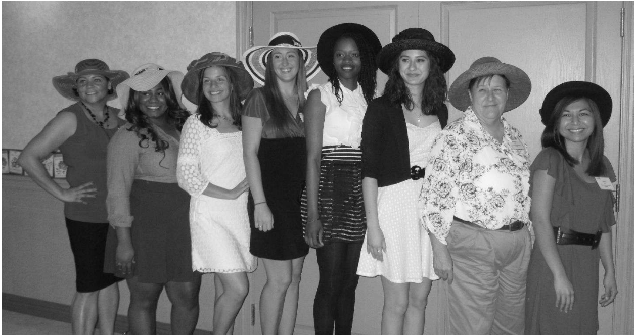
Picture of our past scholarship recipients taken at the May 2015 meeting.